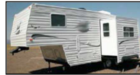
Fifth Wheel/Camping Trailer

REQUIRED TO BE REGISTERED NOT ELIGIBLE FOR PERSONALIZED TRAILER PLATES