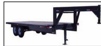
Livestock/Farming Owned by Farmer For Transporting to Market