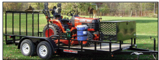
Utility-Open or Enclosed used in any Conveyance of Business other than a farmer-owned trailer used for transporting goods to market.