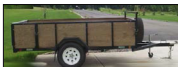
Utility-Open or Enclosed for personal use only

REQUIRED TO BE REGISTERED NOT ELIGIBLE FOR PERSONALIZED TRAILER PLATES